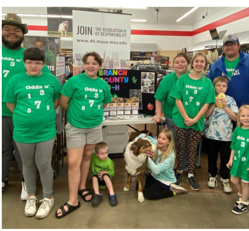
Odds N' Ends 4-H Club booth at TSC during 4-H Paper Clover Sales

659 4-H Youth Enrolled 137 Adult Volunteers 34 Community Clubs 3063 Total Youth Reached